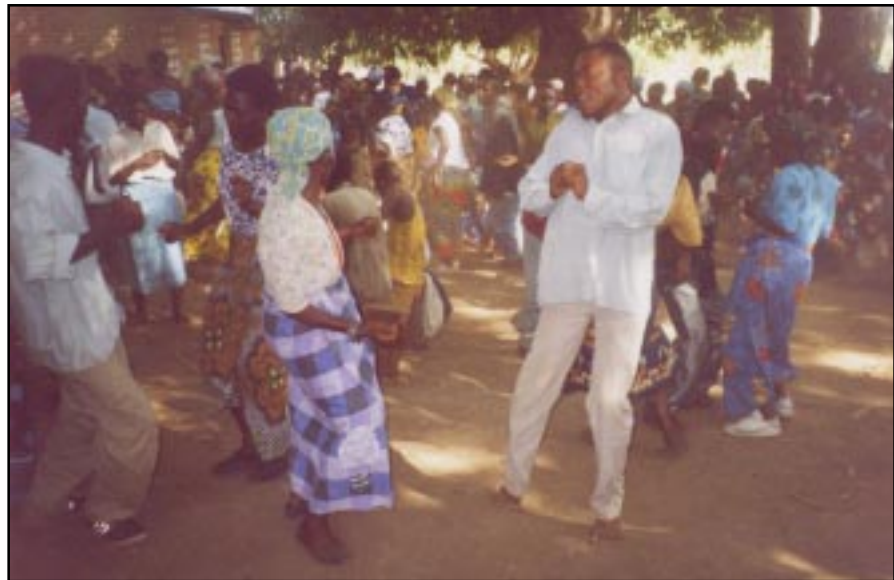
Actors dance with the audience at Mchilima

face informal interaction with members of the communities. Their expertise created good rapport that encouraged the community members to share with the researchers even what the communities consider to be