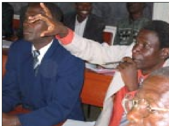
It was all joy during the training as the old timer teachers and new ones honed professional skills

Mentors teachers and Mentor Community Leaders are people selected to assist Primary Education Advisors in managing school clusters in an education zone. ■