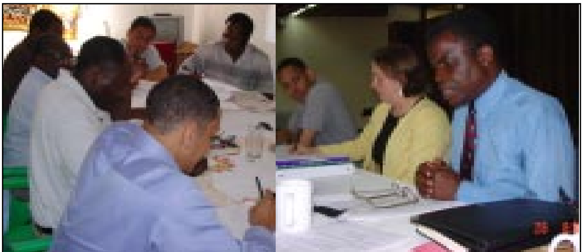
During some of project planning meetings -MESA and AIR Officials

intermediate results of teacher professional development by providing teacher in-service training, community mobilisation by empowering school communities to