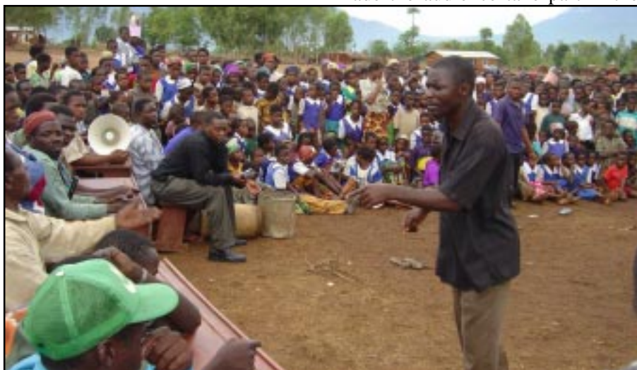
One of the actors interacts with the audience at Chimbiri

They used the findings to create plays. The plays were staged before the community at an open arena. The participatory nature of the drama made the audience take part in the