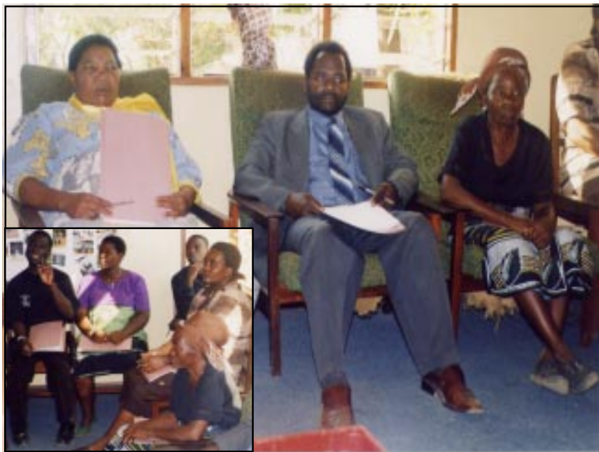
Part of the group of participants, leaders of the ruling and opposition political parties share a common goal, fight HIV/AIDS and promote education, in MESA

At the end of the meeting the participants were seen offering each other lifts.■